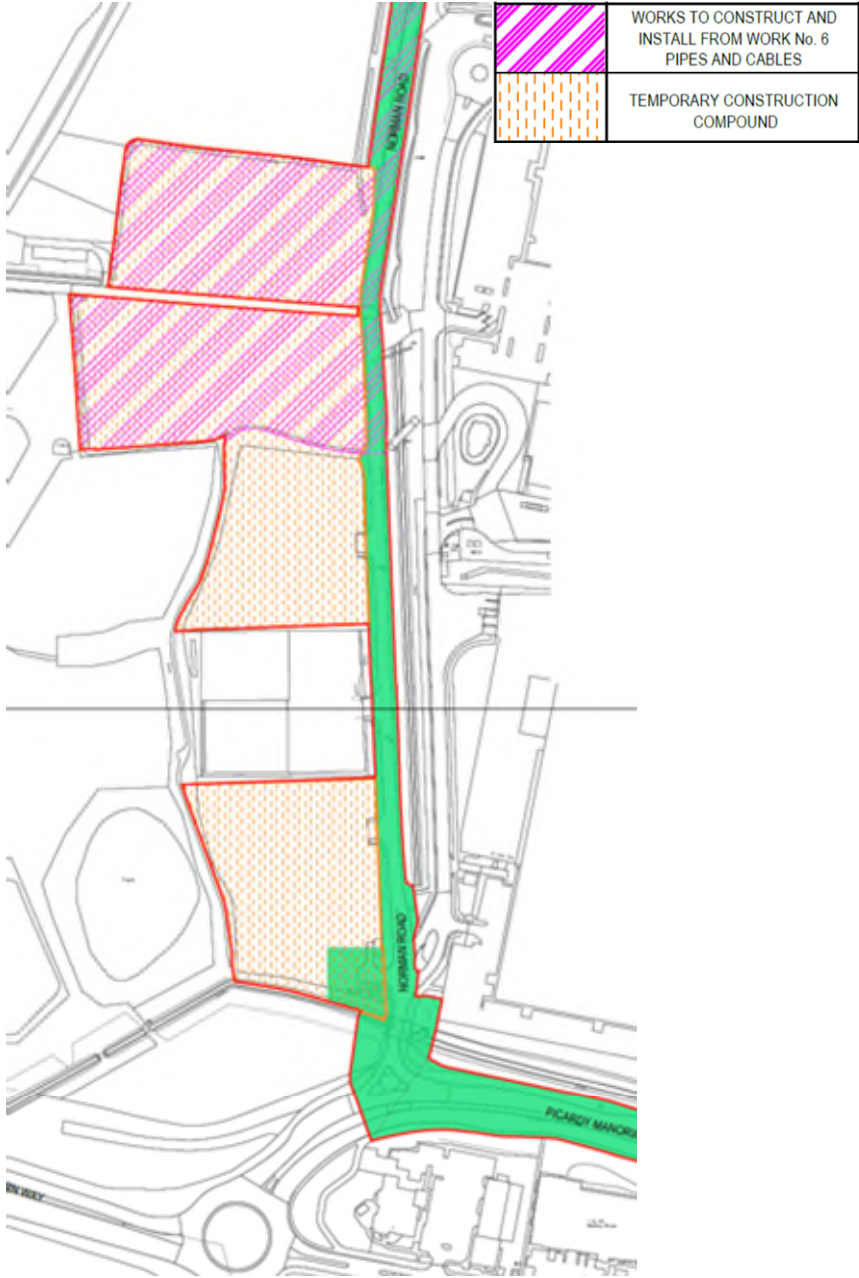
Figure 5-1: Main Temporary Construction Compound Location